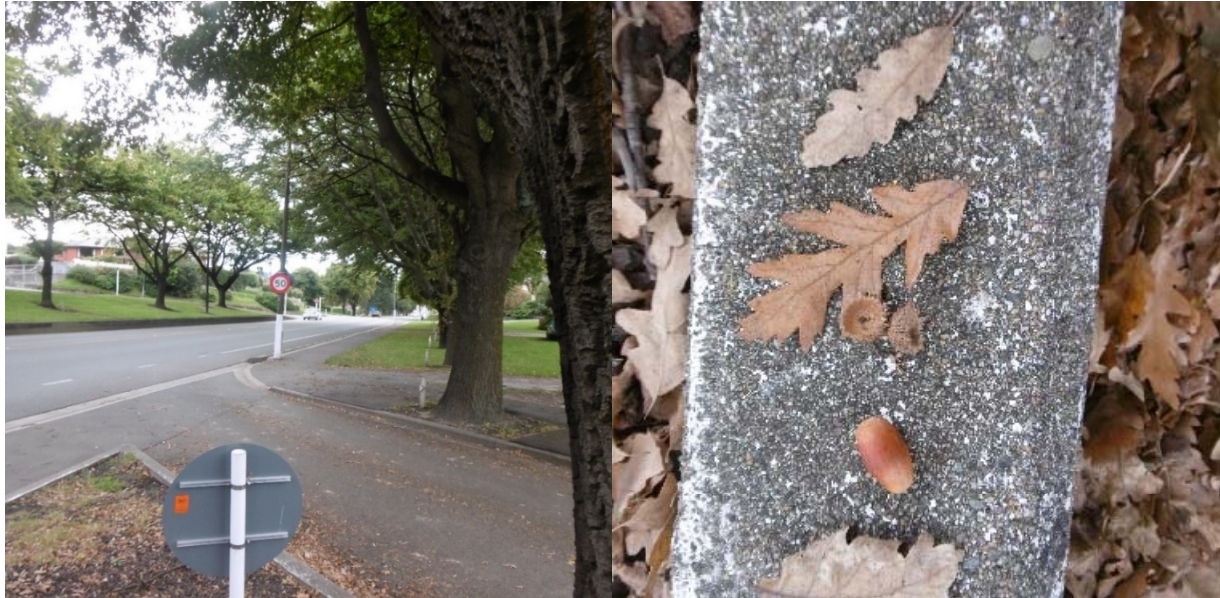
Above) Left: Oamaru Memorial Avenue, State Highway 1 looking north towards town and (right): leaves of its constituent Turkey oaks (Quercus cerris)[upper] and European / 'English' oaks (Q. robur)[lower].