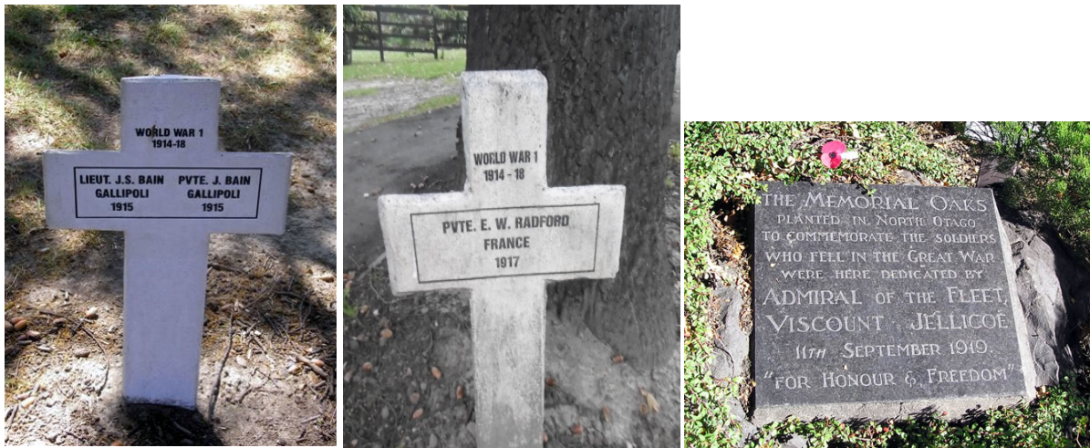
Two examples of white concrete replacement crosses installed by Oamaru volunteers since the early 1990s – the original crosses were timber. Left-hand image shows two brothers, jointly commemorated (NZH). Central image is a single commemorative cross (S. Read). Right-hand image is a plaque at what is likely the first-planted tree, downtown, noting the dedication date of 11/9/1919 (NZH).

By 1994 117 oaks had survived disease, road works, crashes. In the 1990s volunteers began replacing wooden markers with concrete crosses (NZH). In the 1990s Waitaki District Council, urged by NZ Historic Places Trust, did a study of its memorial oaks. A committee is replacing plaques and replanting lost trees (RB).