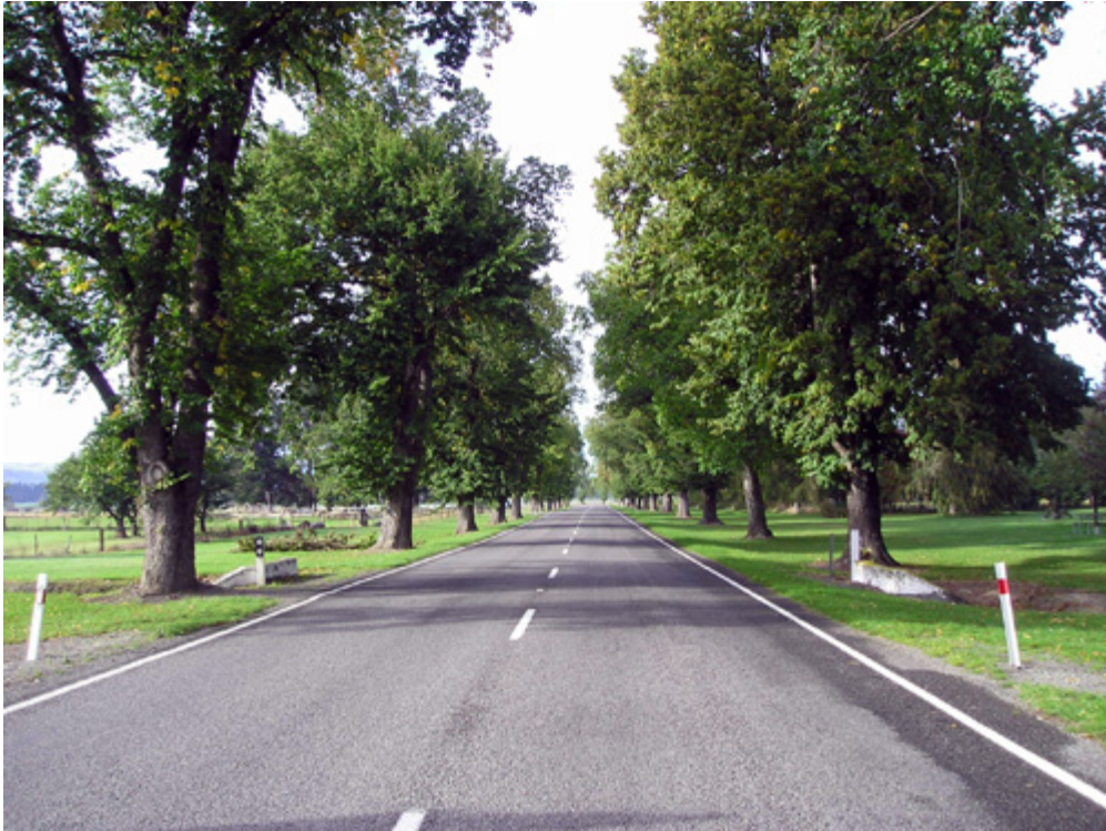
Fairlie Peace Avenue, Mackenzie, South Island, some 500 oak trees line the main road celebrating peace (NZH)

While not an avenue, Timaru's c1902 South African (Boer) War Memorial had an additional honour roll panel added for WW1 dead on 25/4/1926. Around its surrounding lawn are what appear formal plantings of Photinia x serrulata which are now trees – these could be 1922 plantings (NZH). Few other Timaru war memorials have plantings, e.g. one tree beside the Timaru Main School memorial (NZH). Mike Roche instead suggests the street going downhill from the front of the war memorial, shown in a 2011 photograph of an avenue of European ash ( Fraxinus excelsior ) (Roche, pers. comm. and photo, 8, 9 & 11/10/2018). Yet another is the Waitaki town of Temuka, where Morgan (2008, 111) cites commemorative plantings. These could be Himalayan cedars behind semi-circular gardens around the Cenotaph in the Domain and Public Gardens (unveiled by the Governor-General Viscount Jellicoe on 10/8/1922 (NZH).